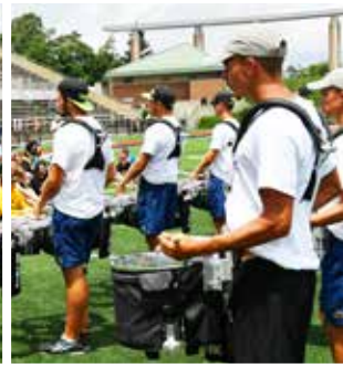
CAROLINA CROWN Corps-in-Residence