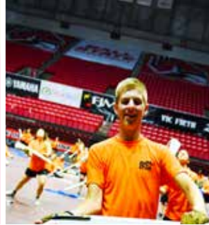
CAROLINA CROWN Corps-in-Residence